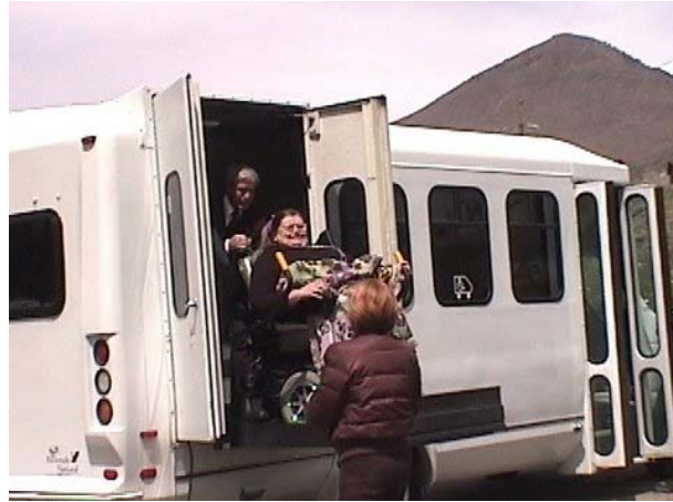
Handi Van Inc. is giving riders like this other transportation options.